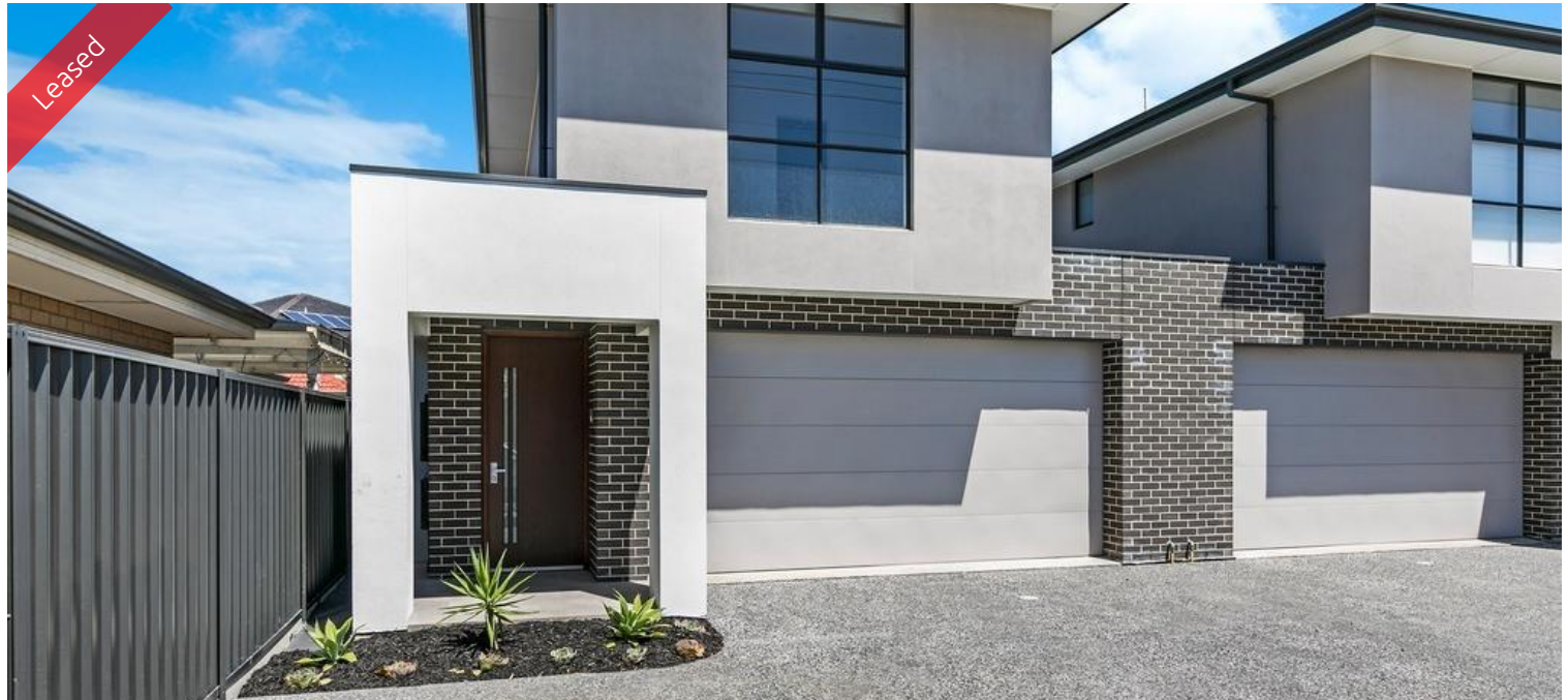
544 & 544A Tapleys Hill Road, Fulham Gardens